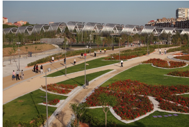
Picture 1-2: With the footbridge Pasarela del Arganzuela star architect Dominique Perrault constructed a landmark for the Manzanares park in Madrid.