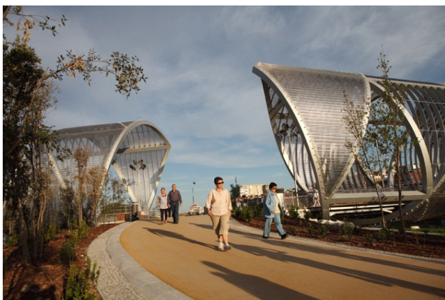
Picture 7: The two spiral-wrapped sections extend far into the park, meeting in the centre on a platform.

We will be happy to send you the desired images in printable resolution by e-mail.