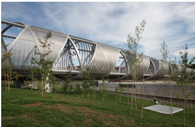
Picture 3: Stainless steel mesh type Escale surrounds the bridge in full length, creating a shimmering helix.