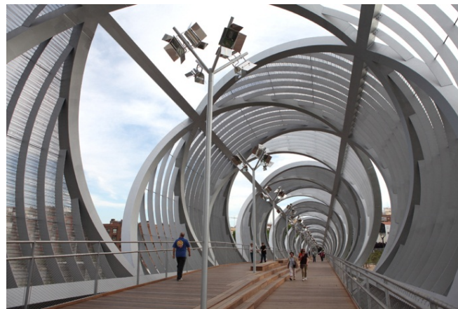
Picture 4: On the inside of the bridge the softly refracted light creates a pleasant atmosphere.

We will be happy to send you the desired images in printable resolution by e-mail.